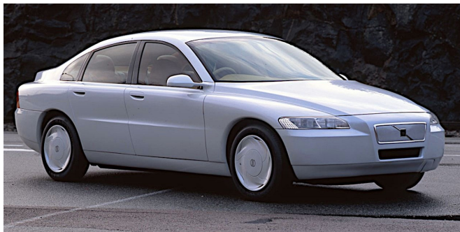
Volvo's Environmental Concept Car (ECC)