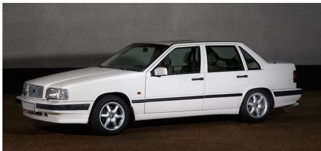
Volvo 850 turbine-electric

Yes, Volvo, noted builder of solid, safe and not particularly exciting cars (well, there were the P1800, 1800ES and C-30). At one point, Volvo installed gas turbines in a couple of vehicles developed from the 260 and 780. The company topped the effort in 1991, when it turned two 850s fitted as hybrids, featuring a combined gas turbine and electrical system to power the car.