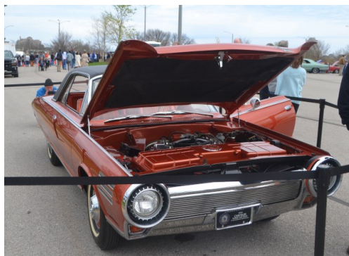
NMOT's Chrysler Turbine at Forest Park, 17 April 2022

Most everyone's familiar with the Chrysler's 1963-1964 gas turbine; the National Museum of Transportation has an example which shows up regularly at the annual Forest Park Easter Concours.