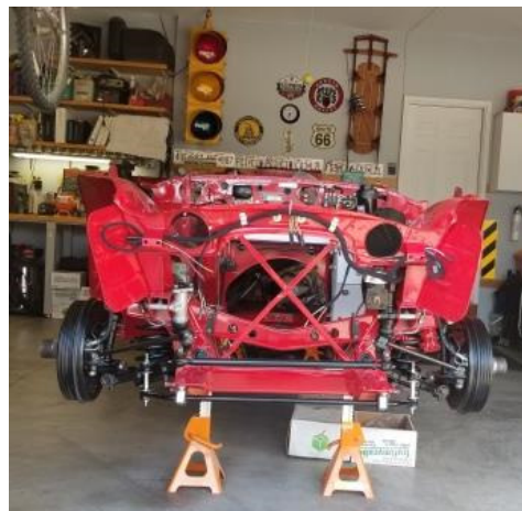
Front suspension with steering is in!