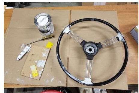
It might work.