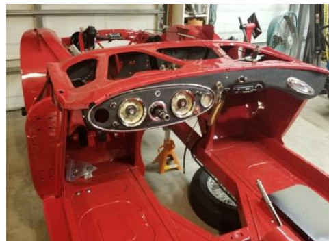
Dash is installed and wired

I am trying to wrap up the details of the chassis but I keep noticing things that need to be installed. Things like the package tray and fresh air vent controls. Or doing things like mounting the heater control in the brand new faceplate upside down and rapidly breaking the faceplate. Not expensive to replace but annoying enough. Surprisingly enough I have had trouble finding suitable silver paint for the wheels. I will let you all know if I found a good silver paint. I want to mount the wheels and drop the chassis on its tires. Probably shouldn't leave them there but it will just feel good to get it back on its tires for the first time in 8 years.